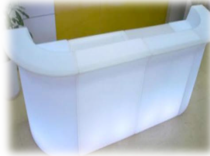
LED Bar Top