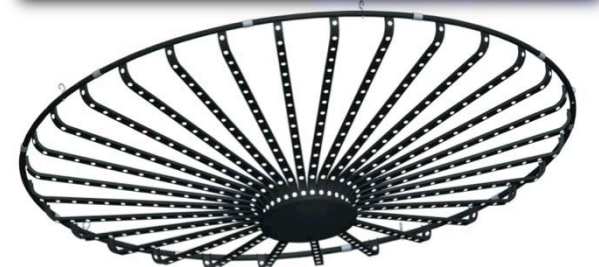
LED Ceiling Spinner